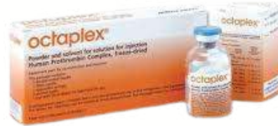
Prescriber category: A*

The amount and frequency of administration will be given based on an individual patient basis. The approximate doses required for normalization of INR ( \leq 1.2 within 1 hour); dosage is expressed in units of factor IX activity.